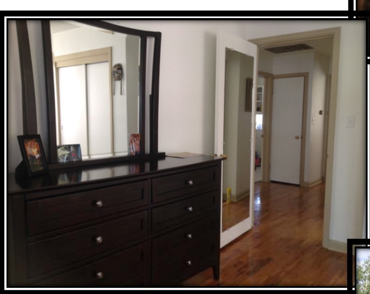
Looking into Hallway